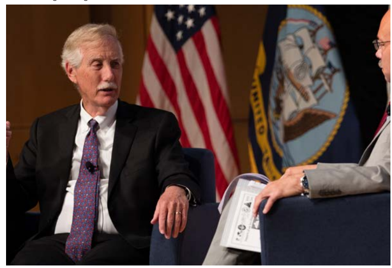
Senator Angus King