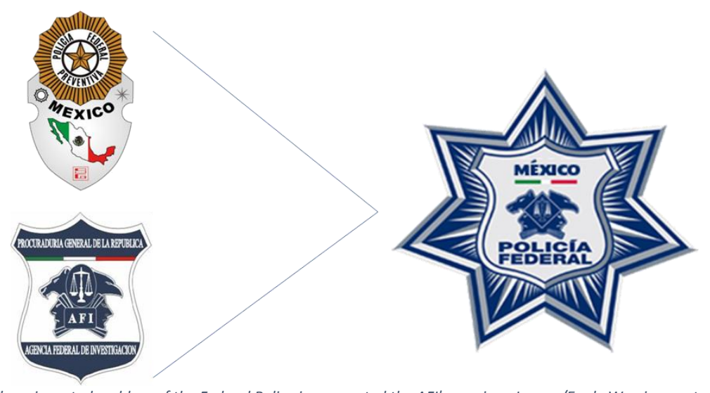
Figure 1. The reinvented emblem of the Federal Police incorporated the AFI's previous Jaguar/Eagle Warrior crest symbolizing Night and day vigilance.

Simultaneously, Genaro Garcia Luna,<sup>6</sup> the founding head of the AFI and later Secretary of Public Security under Fox, launched an ambitious expansion and transformation program for the PFP. The PFP dropped its "Preventive" title and was renamed as the Policia Federal in 2009 and reorganized into four divisions. The PF absorbed the investigative capabilities of the AFI, although in theory the AFI remained under administrative control of the PGR, which was headed by Eduardo Medina Mora.<sup>7</sup> Collaboration between both institutions was fragmented by intense personal rivalry between Garcia Luna and Medina Mora.<sup>8</sup>