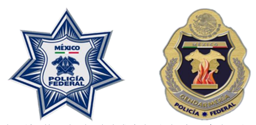
Figure 2- the Gendarmerie's emblem took on the Federal Police (and previously AFI) Jaguar/Eagle Warrior crest but included a burning flame that symbolizes "transformative fire"

Nevertheless, the Gendarmerie was created on 22 August 2014 with an approved force strength of 5,000. It was to be a part of the CNS, mainly as the seventh division of the PF, joining 1) Intelligence, 2) Regional Security (Highways), 3) Counter narcotics, 4) Investigations, 5) Federal Forces and 6) Scientific divisions. Intergovernmental and political compromises led to the redesign of the Gendarmerie from a mainly military organization specialized in counter organized crime activities to a civilian-led organization with a relatively diverse and somewhat unorthodox set of roles and missions. As the new Gendarmerie was looking to 'find its place' among the Mexican security community, it took on innovative, yet isolated roles such as the protection of 'economic cycles' via its rural security group, providing physical security for citrus producers in northern Mexico, border security, tourist safety, environmental protection, and community policing – the last three of which are not traditional for an intermediate force.