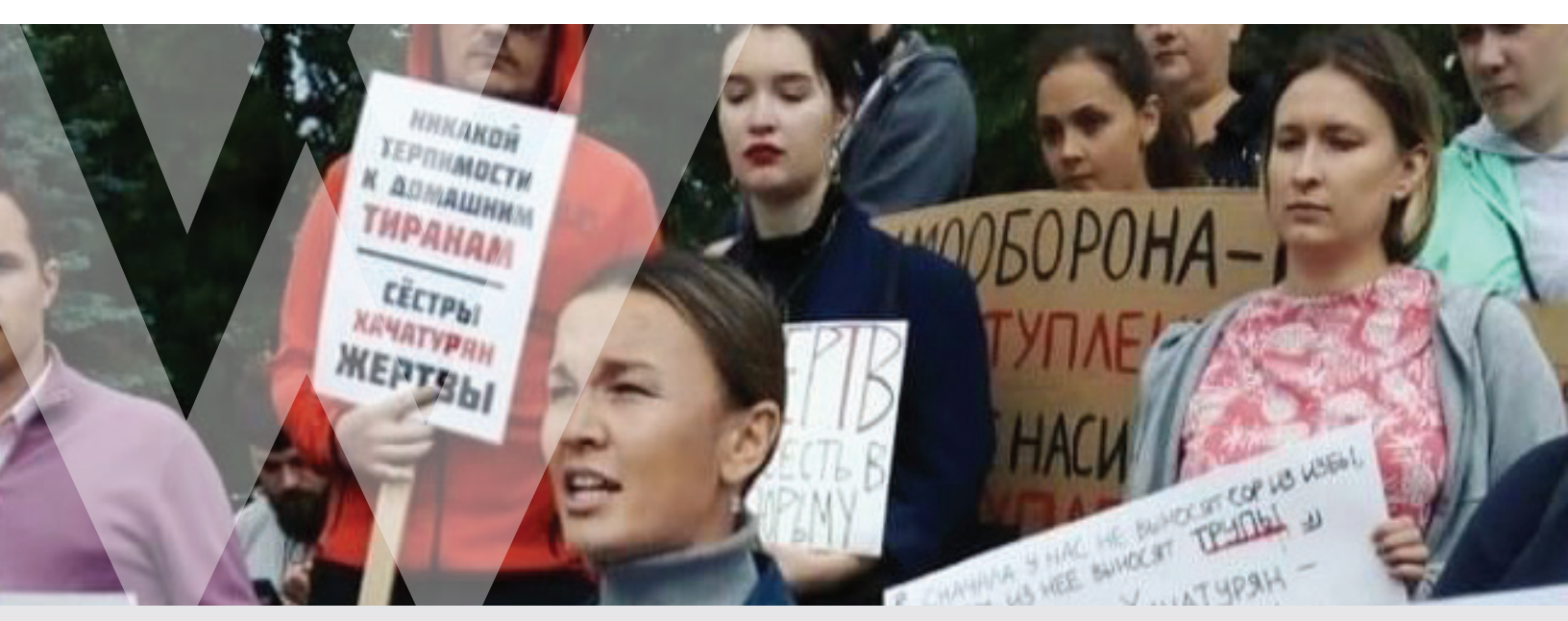
Nizhny Novgorod, Russia (June 28 2019). Author attends a rally against domestic violence.